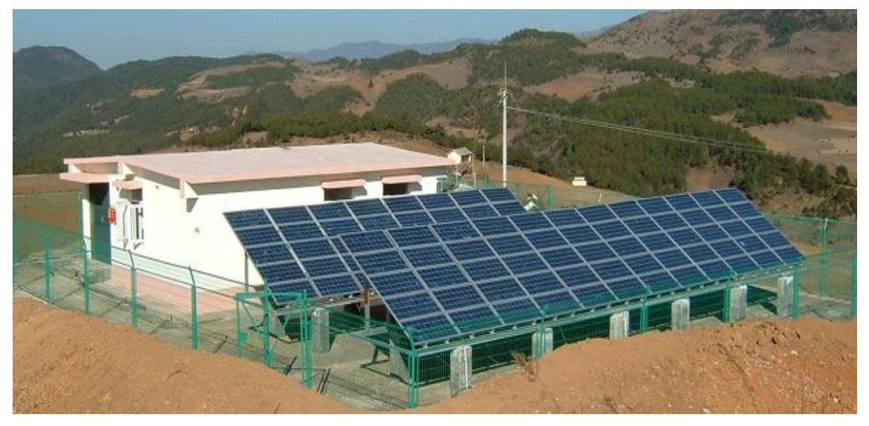
Figure 2 Solar PV Array and Battery/Genset Building