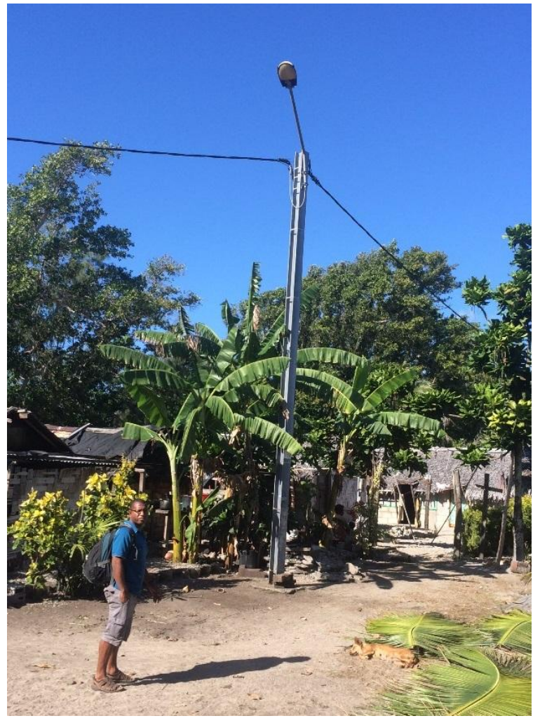
Figure 3 Power Pole and Distribution Lines